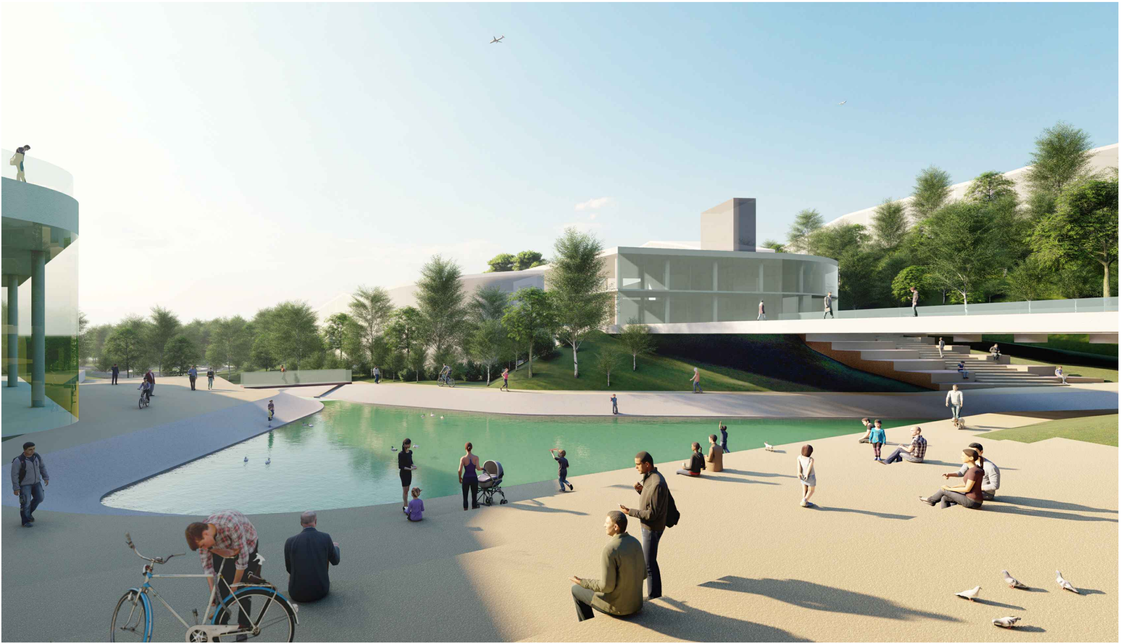
POGLLED PREMA ZGRADI KNJIŽNICE